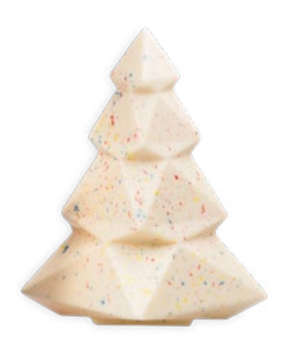
397702 LUXURY CHRISTMAS TREE WHITE

Milk Chocolate Christmas Tree figurine has been sophisticatedly and dashingly sprinkled with white chocolate. It recalls the beauty and a fresh aroma of the winter tree decorated with shining Christmas chains.