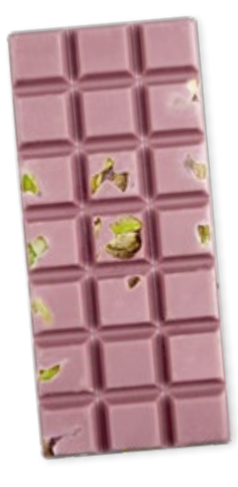
973002 RUBY EXPERIENCE PISTACHIO The unique Ruby chocolate, hand-decorated with crunchy pistachios, will create an unforgettable taste experience.