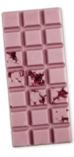
973000 RUBY EXPERIENCE RASPBERRY

RUBY EXPERIENCE Package dimensions: 148×73×12 mm Net weight: 70 g Net price: 12,43 EUR