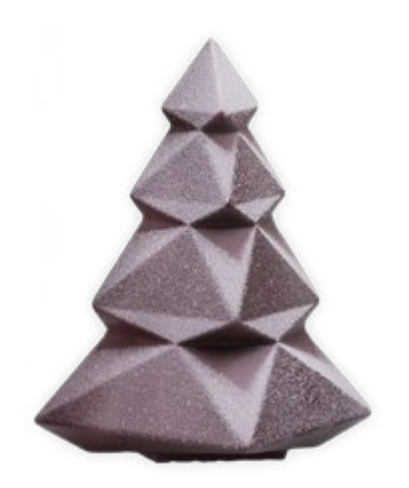
397700 LUXURY CHRISTMAS TREE DARK

The Christmas tree – one of the most beautiful symbols of Christmas. All trees are seemingly the same, and yet each is different and unique. It's the same with Chocolissimo chocolate Christmas trees. Although they are made according to one pattern, each is hand-decorated.