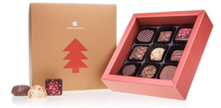
368101 CHRISTMAS MIDI SQUARE Package dimensions: 148×148×40 mm Net weight: 110 g Net price: 17,94 EUR A box containing 9 chocolate pralines with fillings.